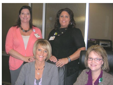
RNs from Lee's Summit and Children's Mercy at the April Chapter lunch meeting

In the coming months, information about Spring Training 2012 will be announced. Make plans now to attend!